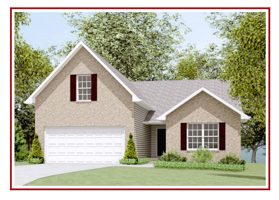
Imperial Series | 2 Car Front Entry Garage | 3 Bedroom | 2 Bathrooms