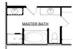
Master Bath Option