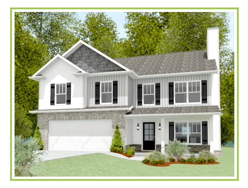
Craftsman Series | 2 Car Front Entry Garage | 3 Bedroom | 2.5 Bathrooms