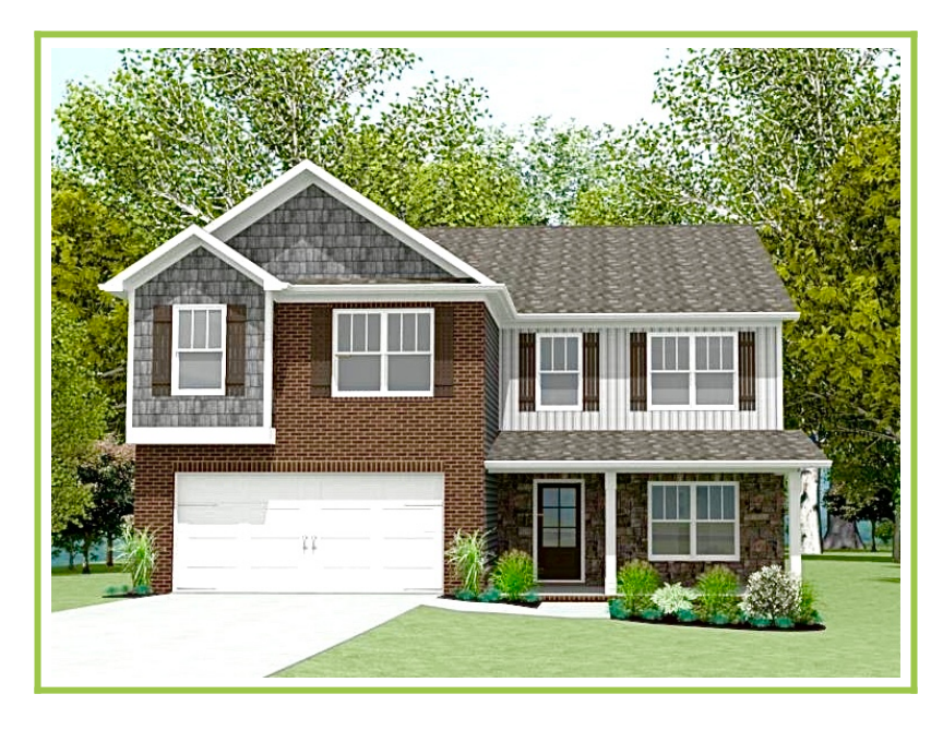
Craftsman Series | 2 Car Front Entry Garage | 3 Bedroom | 2.5 Bathrooms