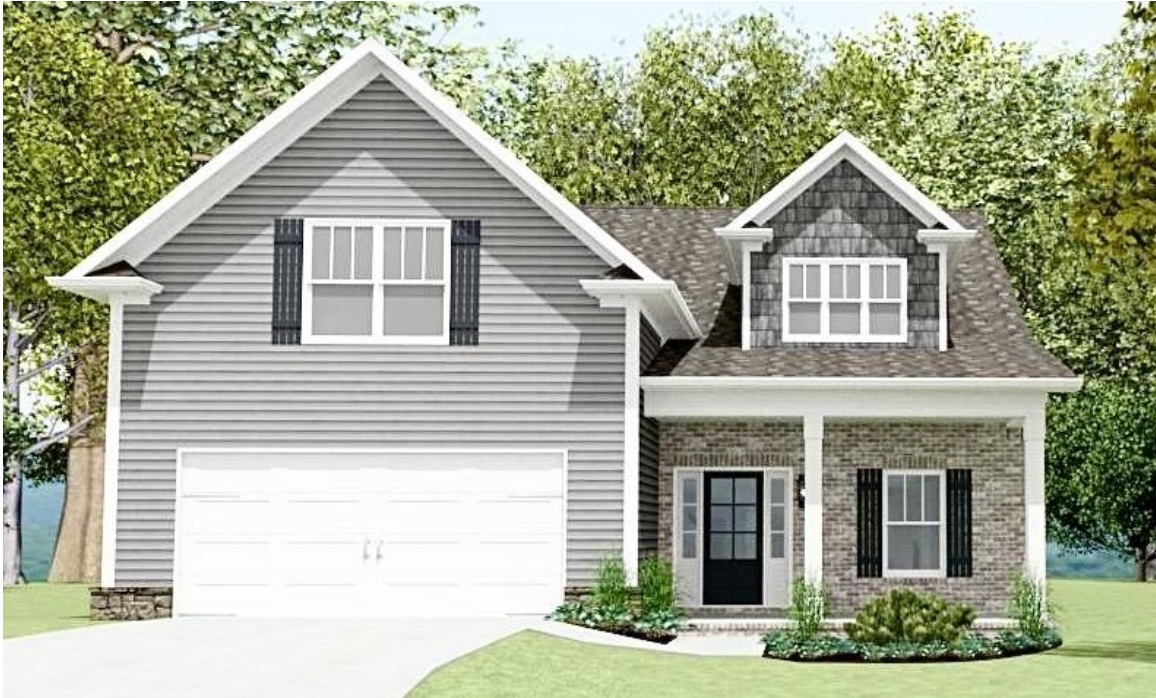
Craftsman Series | Front Entry Garage | 3 Bedroom | 2.5 Bath